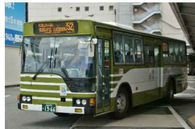
bus of “Hiroshima Electric Railway Co. Ltd.

If you use a bus, you can find the route on Google map (from “Hiroshima station” to “Bunka Koryu Kaikan”).