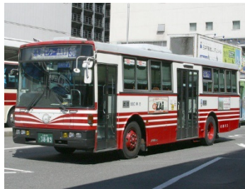
bus of “Hiroshima bus co. ltd.”